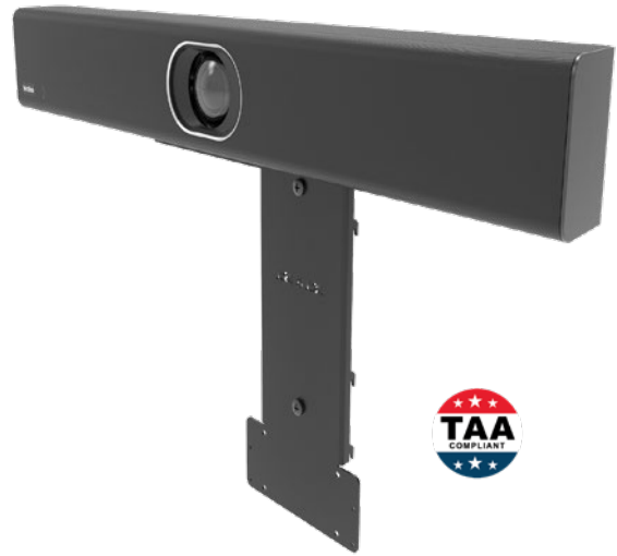
MeetingBar A20/A30 Mount