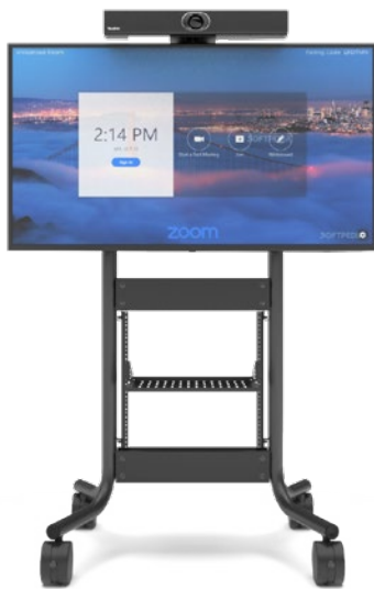
Yealink MeetingBar Mount shown on RPS-500