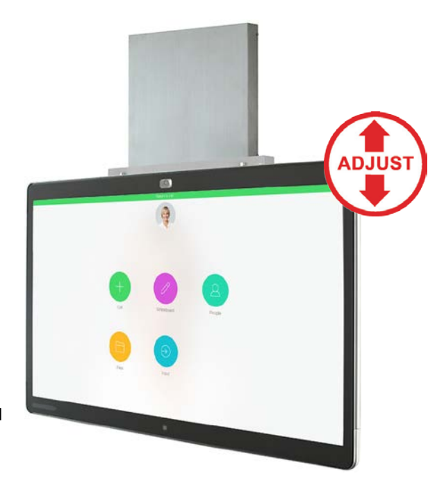
Shown the 55" Cisco Spark Board