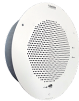
011398 SIP Talk-Back Speaker