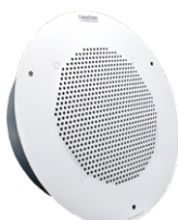
011121 Auxiliary Analog Speaker