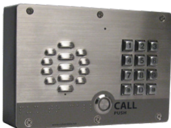
011214 SIP Outdoor Intercom with Keypad