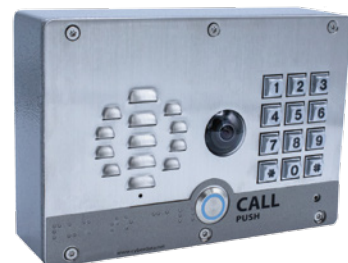
011414 SIP h.264 Video Outdoor Intercom with Keypad