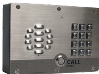
011310 Singlewire InformaCast Outdoor Intercom with Keypad