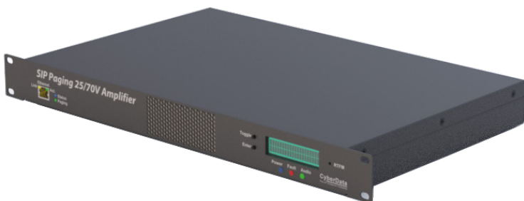
011590 SIP Paging 25V/70V Amplifier