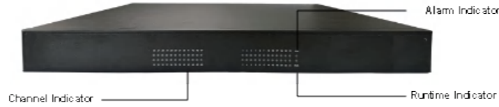
Figure 1 GA100-48R Front View

1. See the figure below for the appearance of the product and follow it to connect lines.