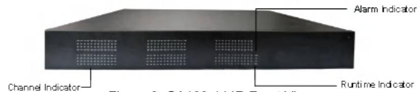
Figure 3 GA100-144R Front View