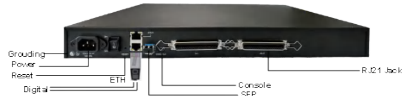
Figure 2 GA100-48R Rear View