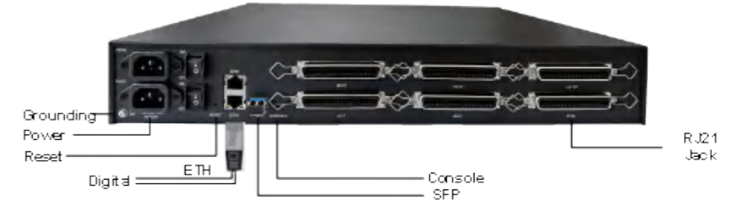
Figure 4 GA100-144R RearView