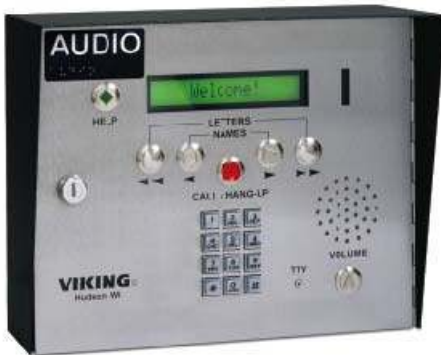
AES-2000S Surface Mount