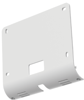
0° Mounting Bracket